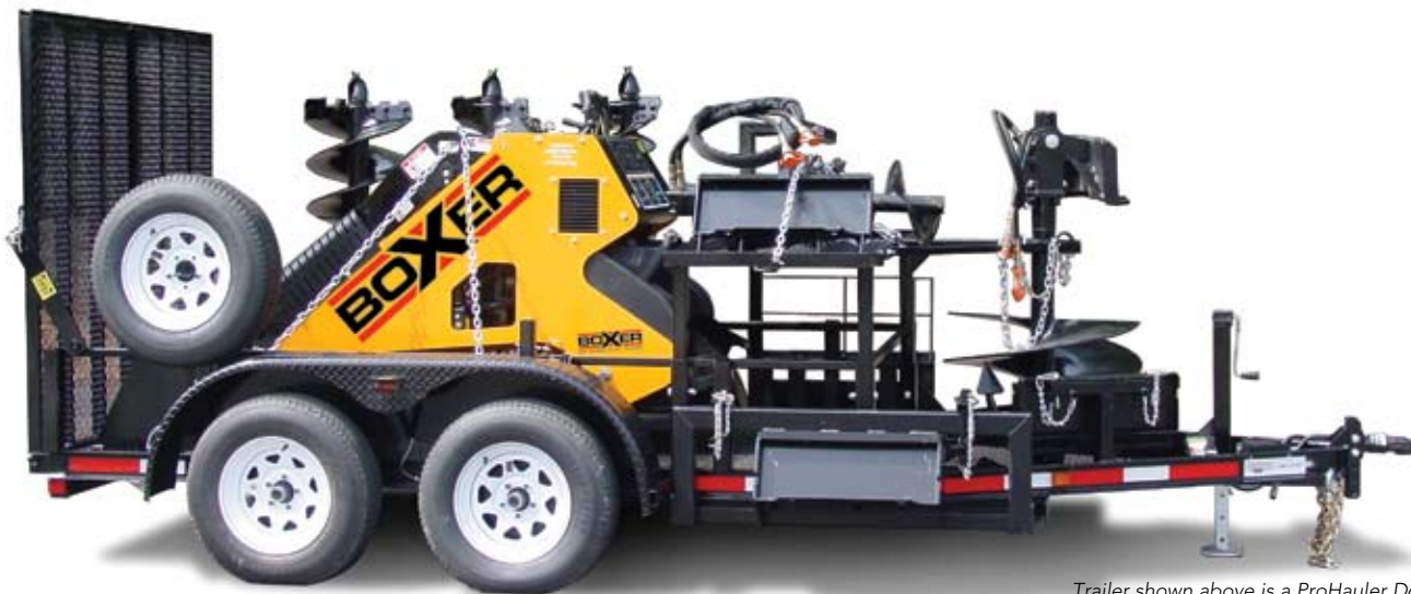
Trailer shown above is a ProHauler D612RTSD

Please see our attachment brochure, visit our website at www.boxerequipment.com or call your local authorized dealer for a complete list of attachments and availability.