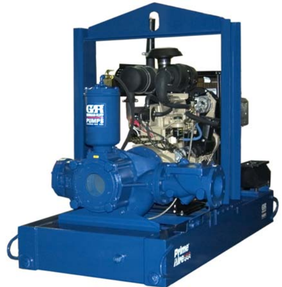
SHOWN WITH OPTIONAL NPT SUCTION AND DISCHARGE FLANGES